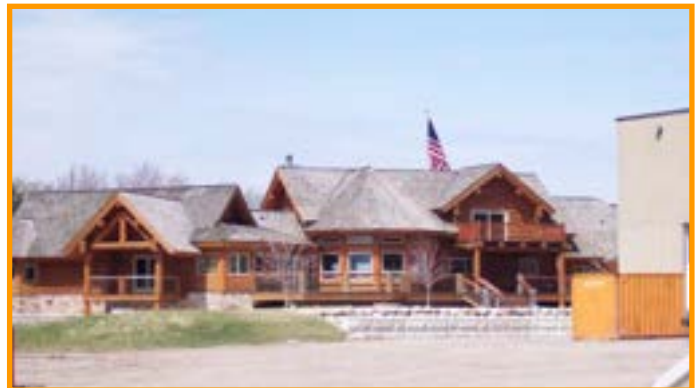
Back side office from yard