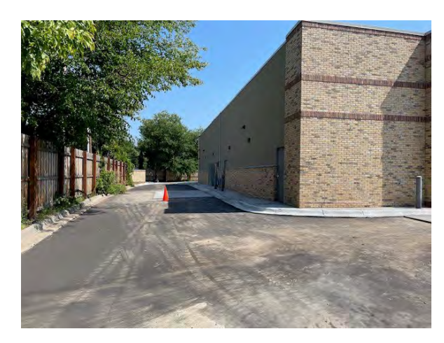
Back of Building