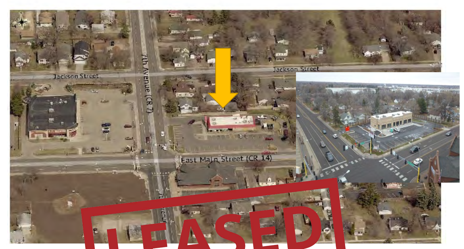
High visibility coner of Average all Street