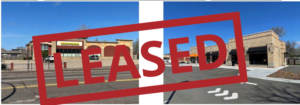
Adjacent to new Dollar General