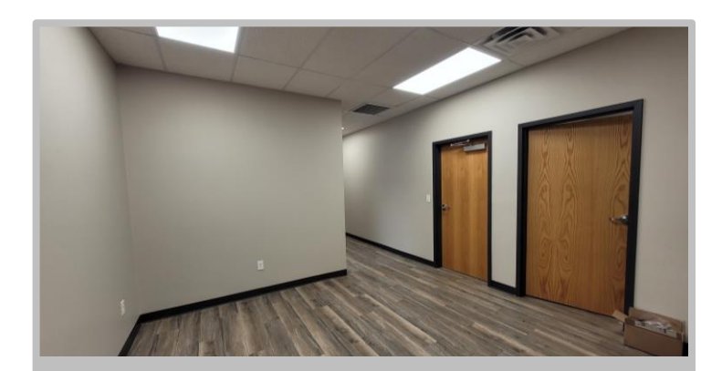
PROPERTY DETAILS $12.00/sf office $6.75/sf WH CAM/Taxes $4.75/sf